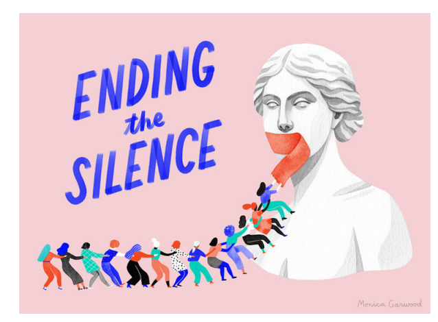
Illustration by Monica Garwood